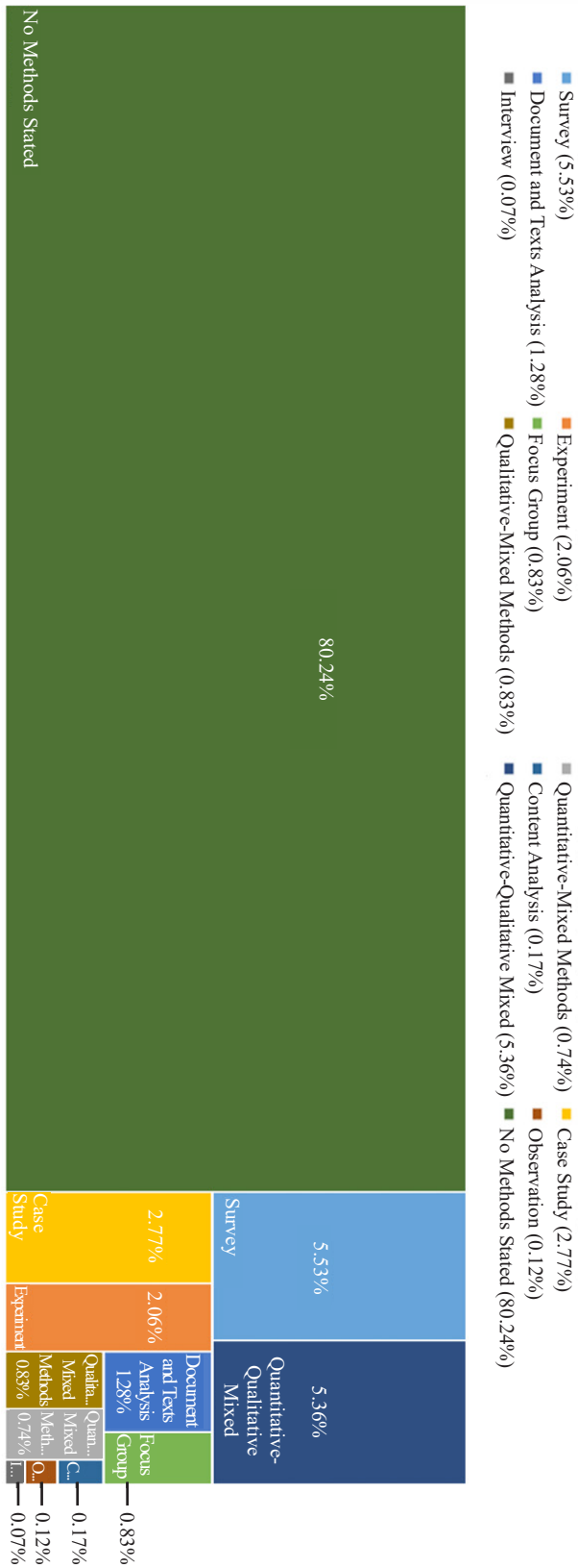
Figure 2. A treemap for visualizing research methods adopted in China's e-commerce research